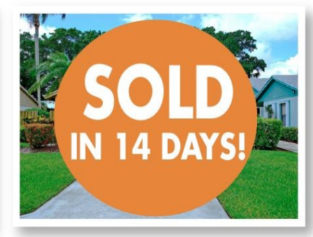
3100 NW 6TH STREET