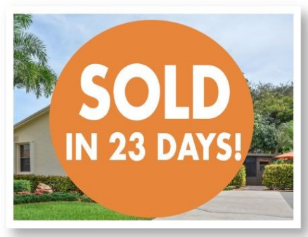
821 NW 32ND AVENUE