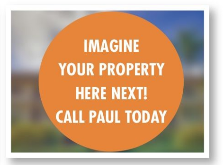
DON'T BE LEFT BEHIND!