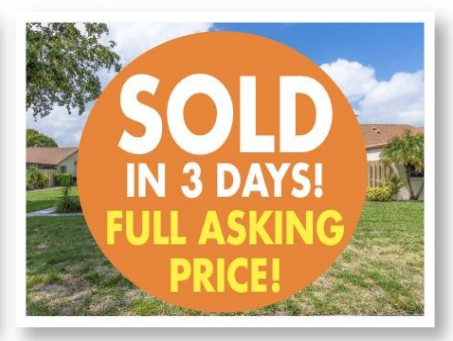
3010 NW 12TH STREET A