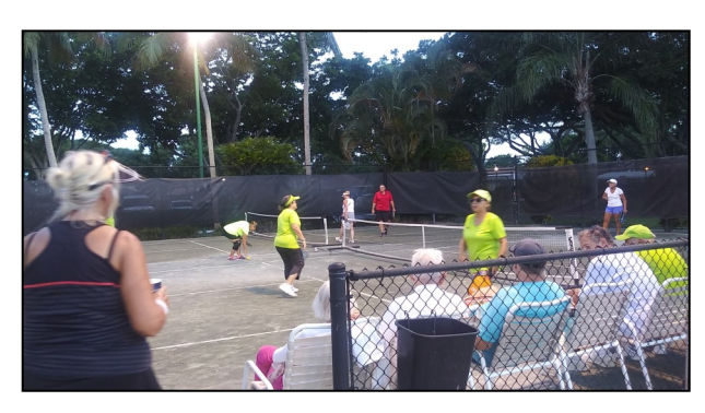
Rainberry Bay versus Valencia Shores

On July 12, our tennis maintenance company laid down 15 bags of Har-Tru. This is a waste if you cannot water and roll it so it can stick to the layer that is already there. If there is any wind, it will just blow away. Our Pickleball players deserve decent courts to play on. It is time we get a dedicated pump for courts 11 & 12.